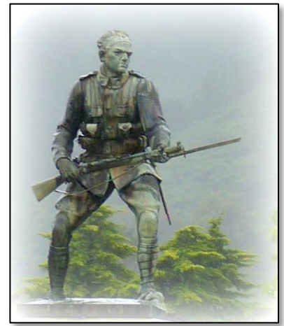
ANZAC – Warwick Kellaway