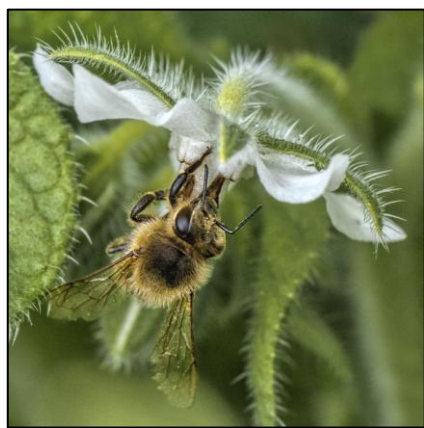
Busy as a Bee – Val Fabling