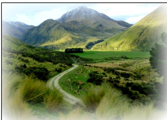
Into the Valley - Warwick Kellaway

How can we show a slice of this wonderful place?....it's your call.