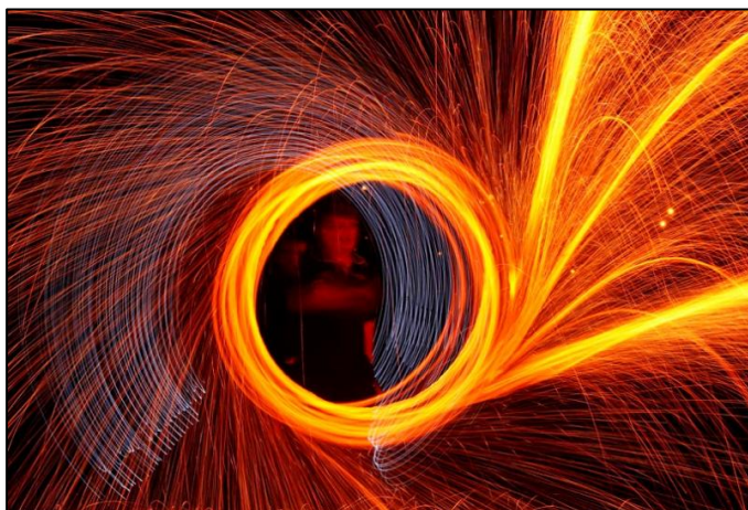
Slow Motion - Fergus Campbell