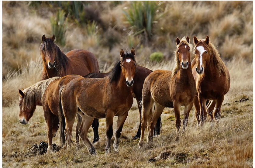
Born Free; Kaimanawas

SO WE NEED TO KNOW WHAT YOU WANT TO LEARN SO THAT WE CAN ORGANISE FUN AND INTERESTING NIGHTS FOR YOU TO COME ALONG AND ENJOY