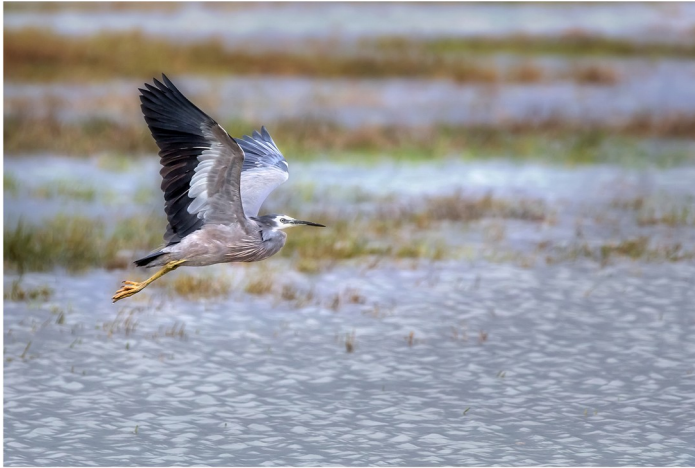
Heron in Flight by Lynda Mowat