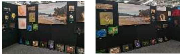
Right: Exhibition at the Aspire Expo. Feb 28 - 29

This month we have our Introduction to Photography workshop being held at 22 Kensington Place. This is free for members, if you want to learn a bit more about operating your camera or know someone then check on the website for more details. We also have our Photoshop skills night at this venue; making sure your photo is sharp by using the various tools in Photoshop. We will have our AGM on the 24 March. Let us know if you want to be on the committee or even just a helper to the committee. Don't forget you need to have paid your membership fees to vote at the AGM. We really need a new secretary and even if we can split the job so one person is the correspondence secretary and another is the minutes secretary that would be great. We have a fifth Tuesday this month so come and meet us at Coffee Culture 7.30pm on 31 March for some great coffee and a chat.