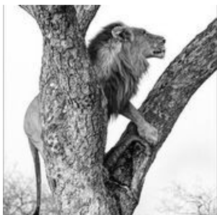
Going Up Lynda Mowat

https://scene.sonyanz.com/competitions/alpha-awards-2020