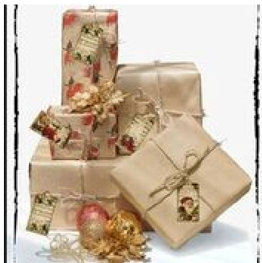
Eco Packaging Val Fabling

# A SPECIAL REQUEST: PLEASE WILL THE MEMBERS THAT ARRIVE EARLY HELP SET UP THE HALL #