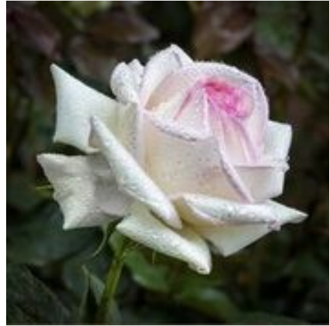
White Rose Covered in Raindrops