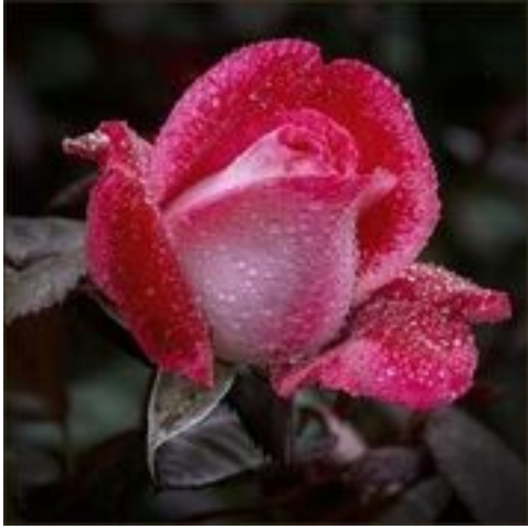
Rain Drops on Red Rose