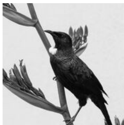
Tui Cara Rintoul