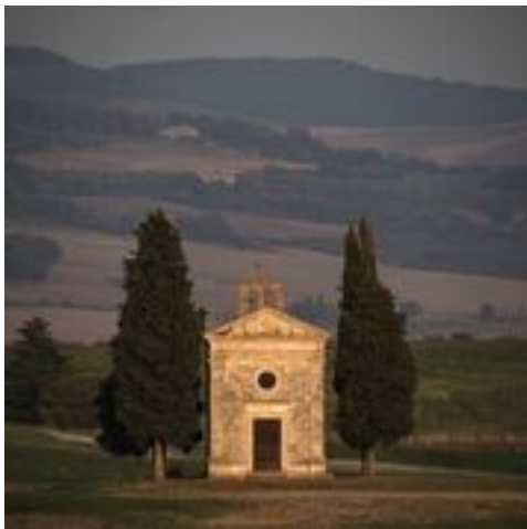
Madonna di Vitaleta Chapel at Sunset