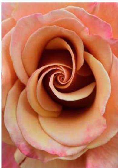
Cates rose