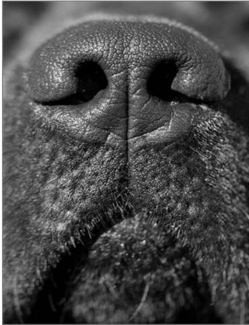
On the nose – Lynda Mowat