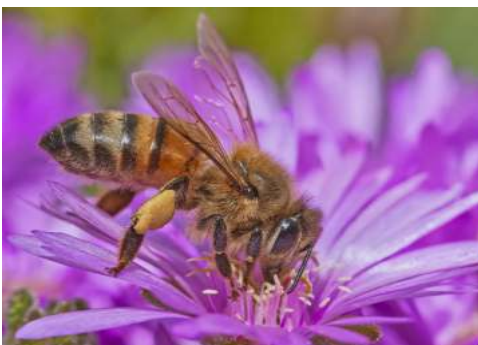
Busy Bee – Hartmut Joschonek

Images entered in this competition are also eligible for entry in the monthly competitions.