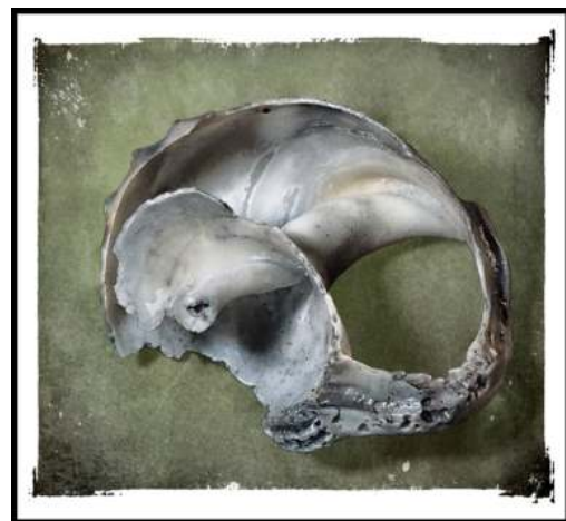
Beauty in Imperfection – by Val Fabling