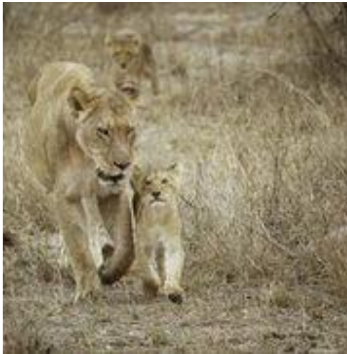
Sticking with Mum – Lynda Mowat

Reflection is a theme that's open to all sorts of imaginative interpretations - from abstract ideas to perfectly symmetrical mirror images. When you first start thinking about reflections, lakes and ponds spring to mind. You don't need much water to capture good reflections. Puddles and wet pavements are often great for reflections. Mount your camera on a tripod. If the water is your reflective surface, the reflection will appear smoother and clearer if you lengthen the shutter speed.