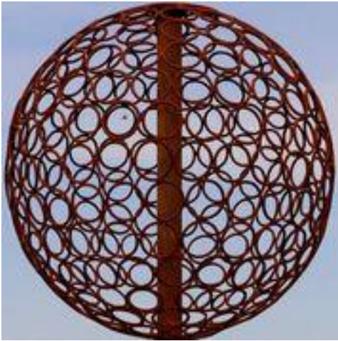
201 circles – Hans Hockey