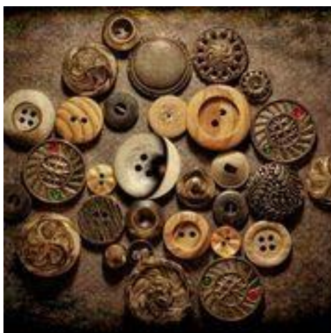
Buttons – Val Fabling