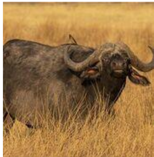
Cape Buffalo – Julie Salisbury