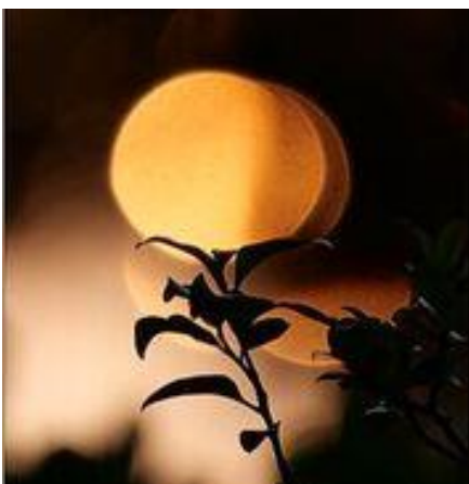
Left: Sunset Bokeh - Kaylene Helliwell