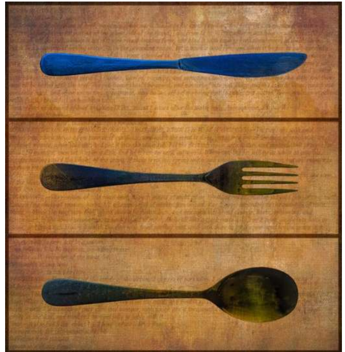
Kitchen Print - Jacqui Stokes

Apology. Two Honours photos from Lynda Mowat were badly cropped in Aperture last month.