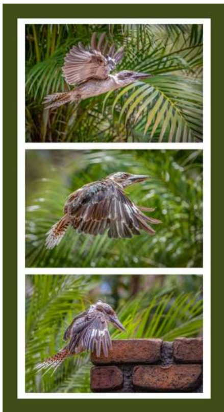
A perfect landing - Lynda Mowat

One way to capture Motion or Action is to photograph any moving subject, from a car, train or a jogger in your local park etc. Nature on a windy day also makes everything move. Motion can also be captured by using longer shutter speeds to show movement. Another way to capture movement or action is to freeze the entire subject such as a bird flying in the sky.