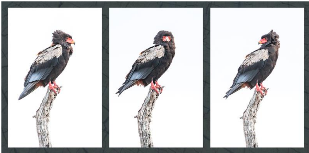
Viewpoint – Lynda Mowat