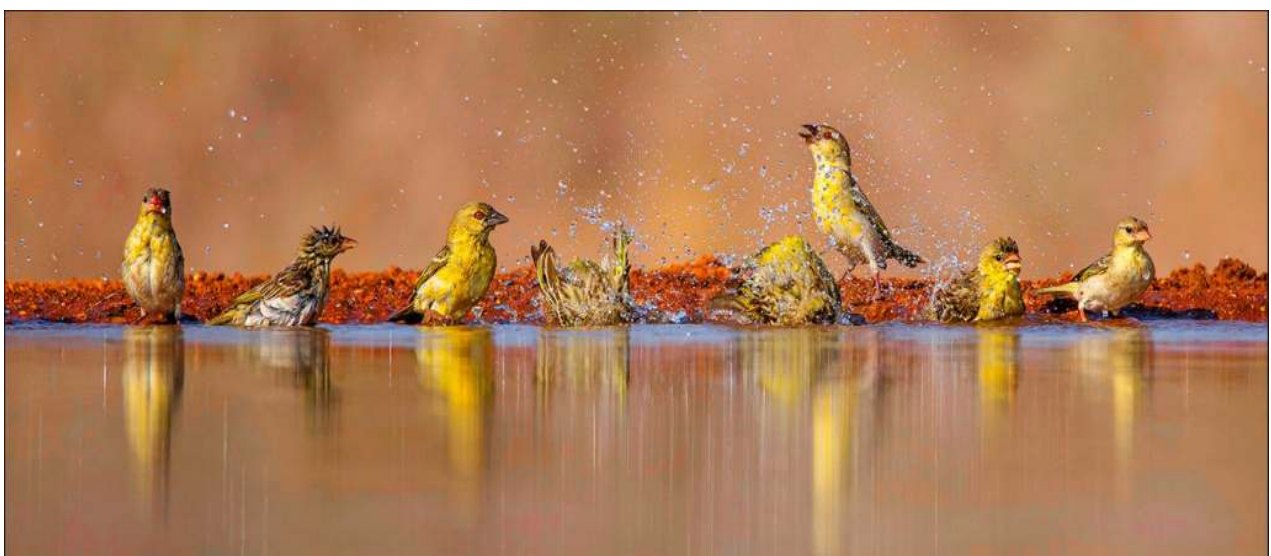
Bathtime – Lynda Mowat

Aperture apologises and reprints them as follows: