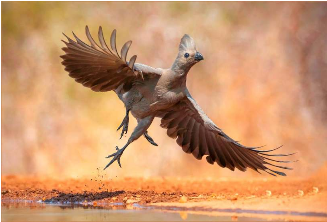
Grey Go Away Bird – Lynda Mowat

Competition Results for Month: JUNE 2020