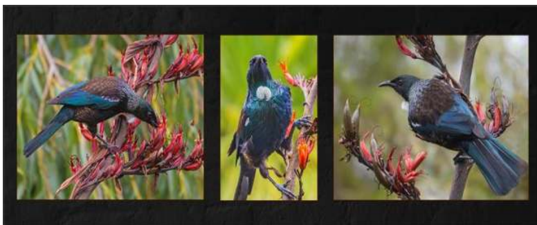
Tuis