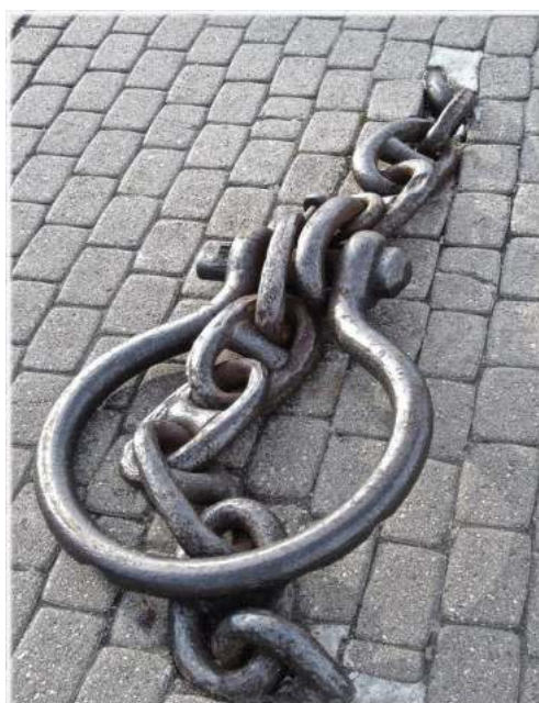
Right: Lockdown Stage 5 – Brian Wills