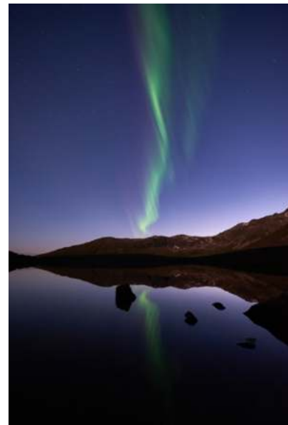
Between the aurora and the water Rhys Jones