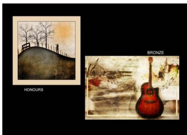
Left photo: Honours