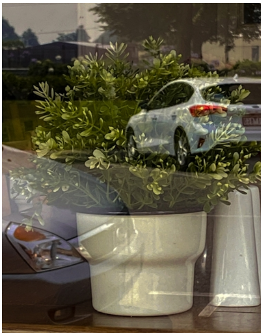
Window Reflections – Kaylene Helliwell

Note: When submitting a photograph into this category, it should be clear that the photograph has been taken at night time or depicts that the subject is in the dark.