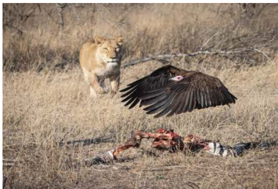
Time to Leave – Lynda Mowat