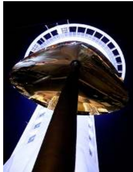
Right: Sky Tower