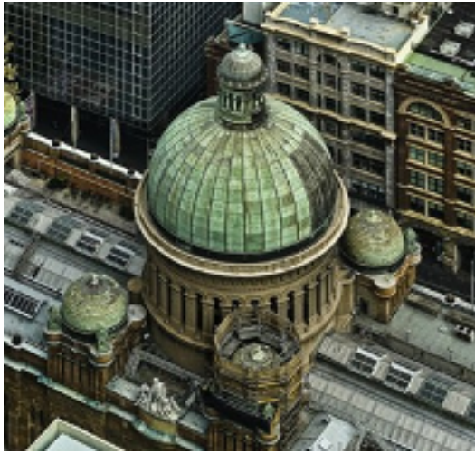
Bird's Eye View – Val Fabling