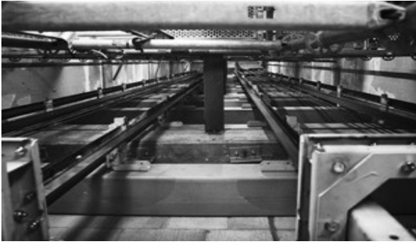
First floor please – Amanda Marshall