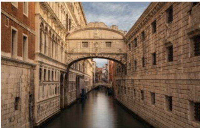
Bridge of Sighs, Venice

PLEASE fill out the entry forms correctly! It's not difficult!