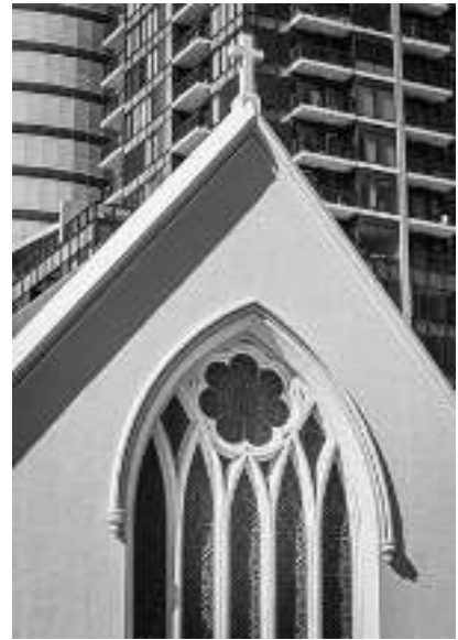
Right: St Patrick's Church