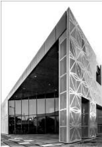
Left: Te Awamutu Library Lynda Mowat LPSNZ