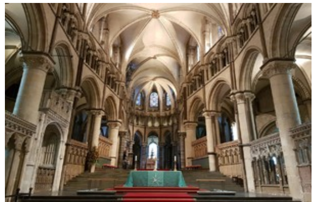
Canterbury Cathedral, Canterbury Max Watson