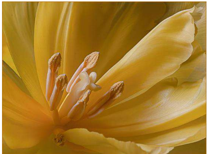
Yellow tulip – Hartmut Joschonek