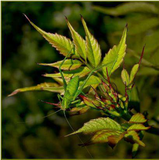
Close Up – Val Fabling LPSNZ