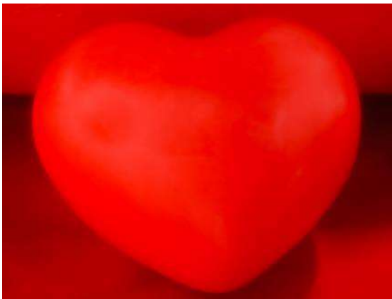
Mystery of the Heart – Kristof Hongsermeier

To create a point of juxtaposition, the picture must contain at least two elements with strong visual weight. The viewer looks at both of these at the same time, coming to a conclusion about the purpose of each element. Have a look at this link by Expert Photography to see 27 examples. expertphotography.com/27-juxtaposition-examples/