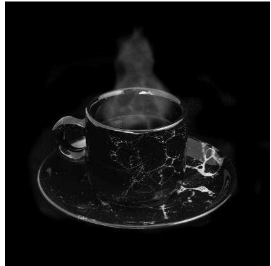
Coffee Break – Lynda Mowat LPSNZ